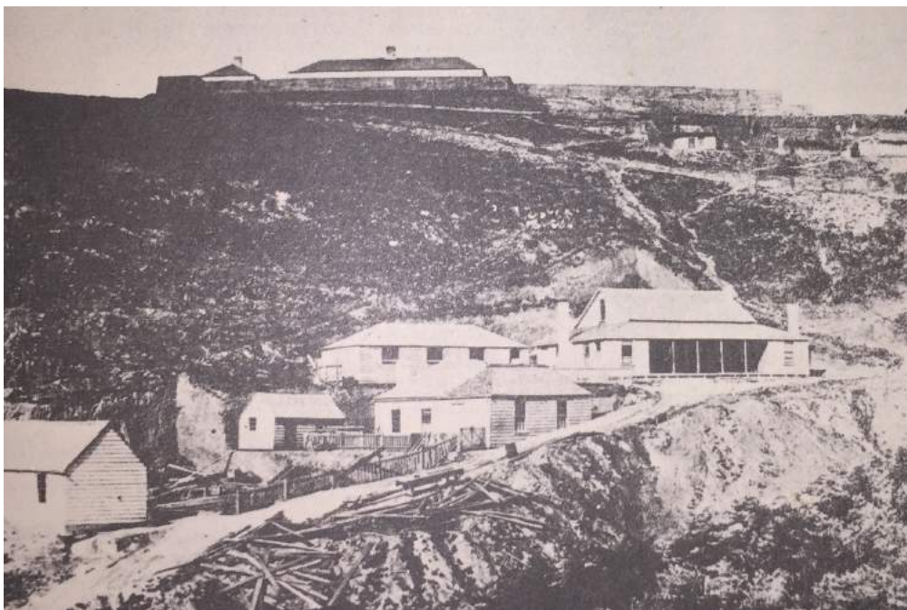
Army barracks in Napier, where immigrants were housed initially

When the immigrant ships arrived in New Zealand the immigrants were taken to a holding place. Local businesses that wanted labour would visit these places and seek to recruit, while the immigrants themselves actively sought employment and housing. Some sought employment where they landed while others quickly moved to areas where the opportunities were considered to be greater.