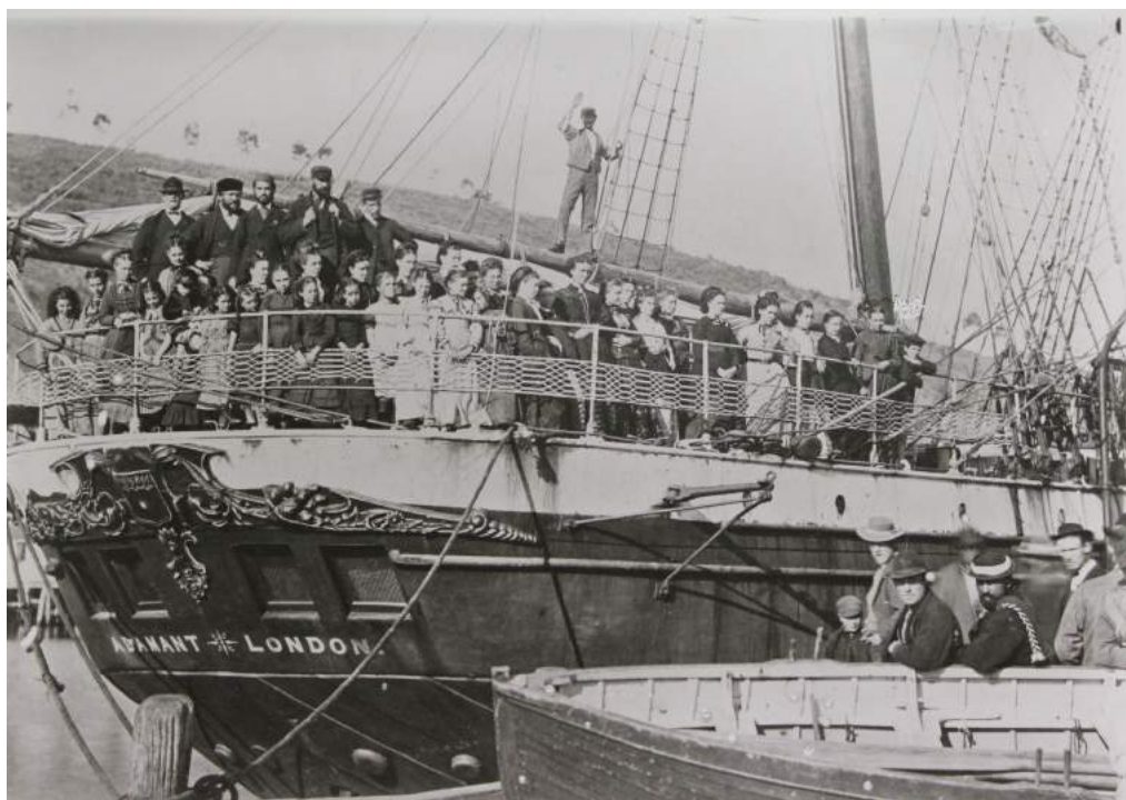
Migrants on the Adamant

The Jersey emigrants had a long and often tortuous journey to New Zealand. It began with a sea crossing probably to Southampton and calling in at Guernsey on the way, then a train journey up to London and probably a few days in London before embarking on the trip to New Zealand. The embarkation ports were generally either London or Gravesend. However, there were a few sailings from Plymouth and also some sailings from London called at Plymouth to embark some migrants. Gravesend, 30 kilometres downriver from the centre of London, requires an explanation. It is probably the case that it was cheaper for boats to sail from Gravesend than from London. The ship typically started in West India dock, then sailed without any passengers to Gravesend. The emigrants were there taken by ferry from Blackwell Pier to Gravesend where they board the ship.